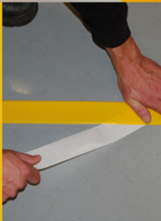
positioning + peel