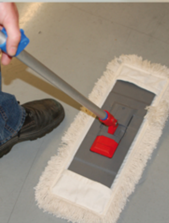
wash + dry

• Uniquely designed bevelled edge helps to eliminate fork lift damage