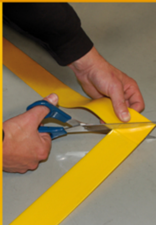
cut + apply